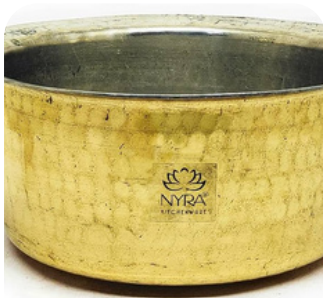
Pital Ganj 2