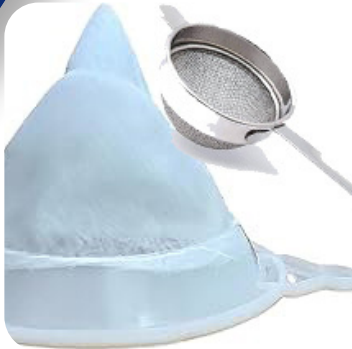
Small & Big Chay Channi