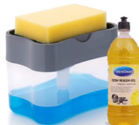
Dish Wash + Gel

Note : The images show are for illustration purposes only and may not be an exact representation of the product. Actual device may different from the image show.