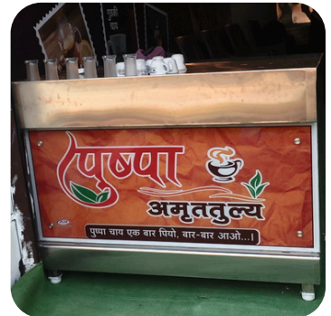
Serving + Cash Counter (5*2)