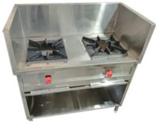
Steel Bhatta (Sigadi)