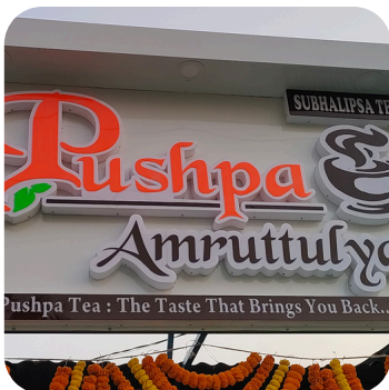
Main Board 3D (6*4)