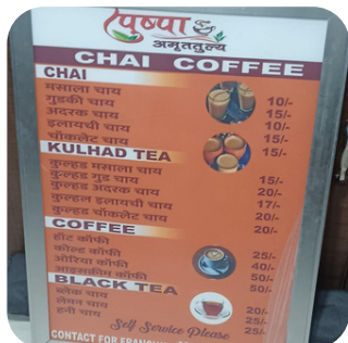
LED Light Menu Board