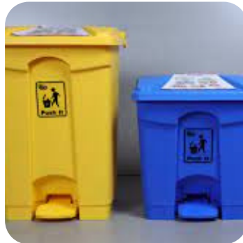
Small & Big Dustbin