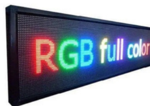
Led Sliding Board